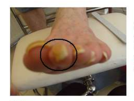
The nails on the 2<sup>nd</sup> & 4<sup>th</sup> digits of the left foot were curled over with marked indentation on the skin.